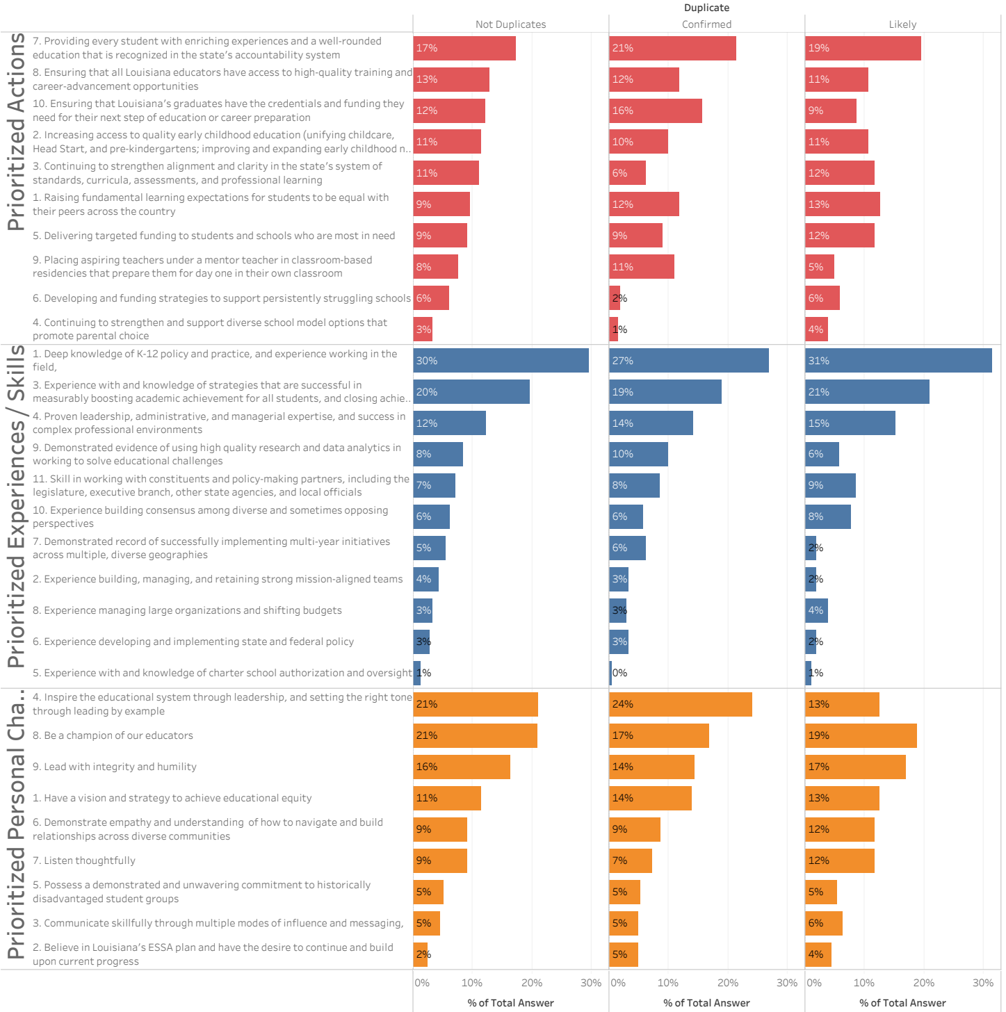
% of Total Answer for each Question broken down by Duplicate vs. Category. Color shows details about Category. Percents are based on each pane of the table.